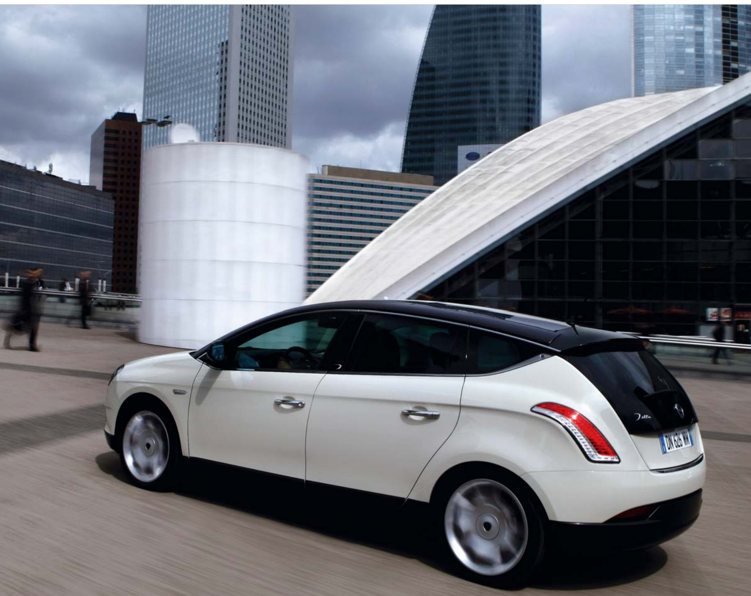
The new Lancia Delta brings Italian elegance to the compact class.

front suspension. Or the Aprilia, which achieved a drag coefficient of 0.47 at the start of the 1930s – a time when other vehicles struggled to beat a value of 0.60.