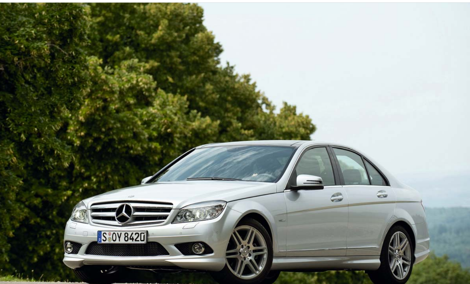
Avant-garde on the outside, green on the inside: The new C 250 CDI BlueEFFICIENCY Prime Edition.

With the C 250 CDI BlueEFFICIENCY Prime Edition, Mercedes-Benz presents the first model of its completely new series of four-cylinder diesel engines, which sets new standards in perfor-