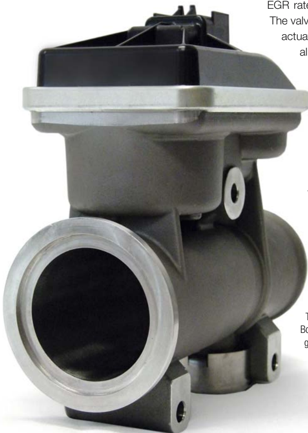
The electrical EGR valve from BorgWarner allows higher exhaust gas recirculation rates.