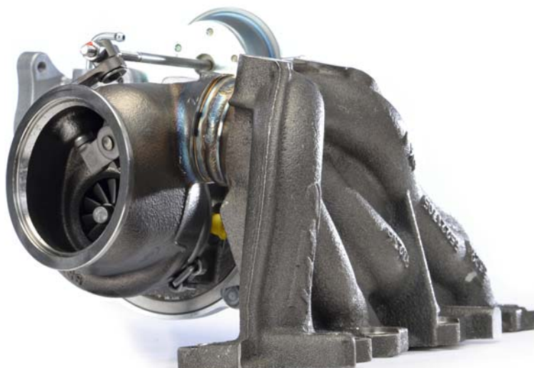
Making jet-like acceleration figures a reality: The K03 turbocharger from BorgWarner.

The top end of the engine range for the Lancia Delta is rounded off by the 200 bhp 1.8 liter di-turbojet gasoline engine.