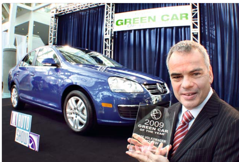
A diesel for America: The new Volkswagen Jetta 2.0 TDI.

Thanks to special coatings, the BV43 turbocharger from BorgWarner is ready for the use of low-pressure exhaust gas recirculation.