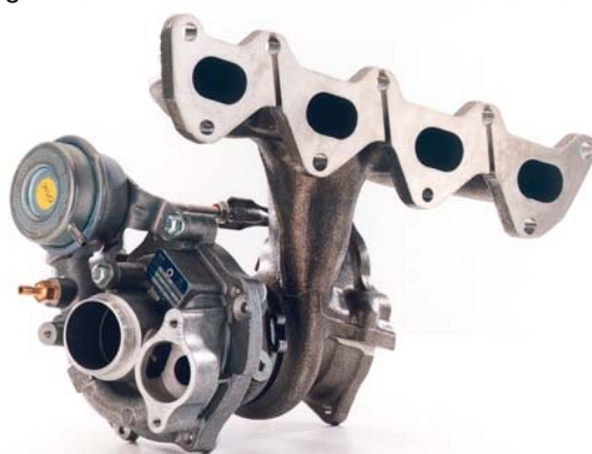
A waste gate turbocharger from BorgWarner gives the small TSI engines a real power boost.

Some 34 years after the premiere of the Scirocco from Volkswagen, the sports car is celebrating its rebirth for those on a tight budget. But this time, the new version of the sports coupé retired 16 years ago is not just a simple variation on the theme of the VW Golf. With its fierce looking front and dynamically sculpted lines, the new Scirocco is much more the rebellious stepson in the Golf family and is set to bring a breath of fresh air to the sports car segment.